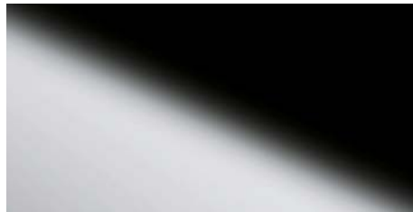
DM OPTICAL MIRROR Silver AR 2800 x 1250 | NA 20877