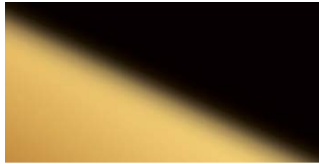
DM OPTICAL MIRROR Gold AR 2800 x 1250 | NA 21243