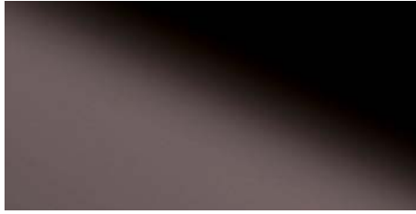
DM OPTICAL MIRROR Anthracite AR 2800 x 1250 | NA 21241