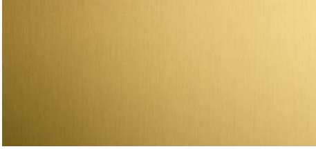
DM Brass brushed matt AR 2600 x 1000 | NA 15290 | SA 15298