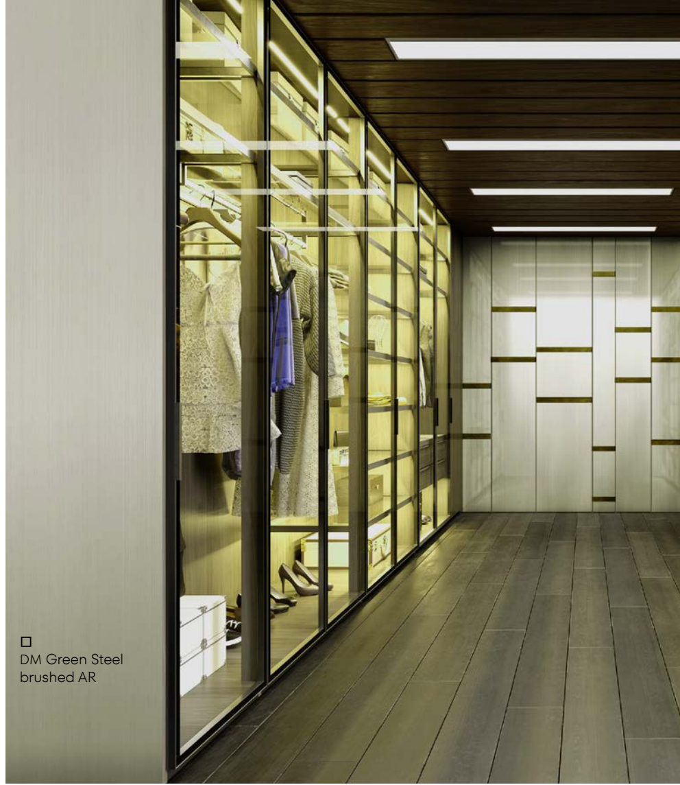
□ DM Green Steel brushed AR