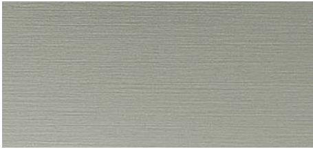
DM Green Steel brushed AR 2600 x 1000 | NA 30467 | SA 30468