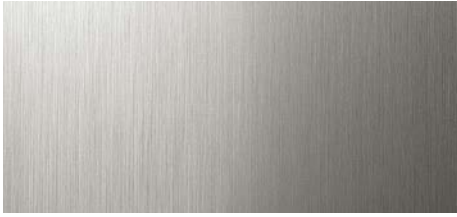
DM Grey brushed matt AR 2600 x 1000 | NA 15289 | SA 15297