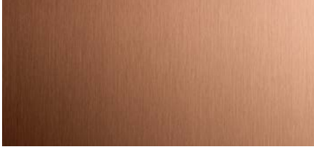
DM Copper brushed AR 2600 x 1000 / NA 12418 / SA 12432