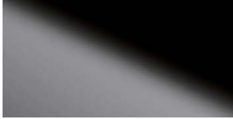
DM OPTICAL MIRROR Fashion Grey AR 2800 x 1250 | NA 21244