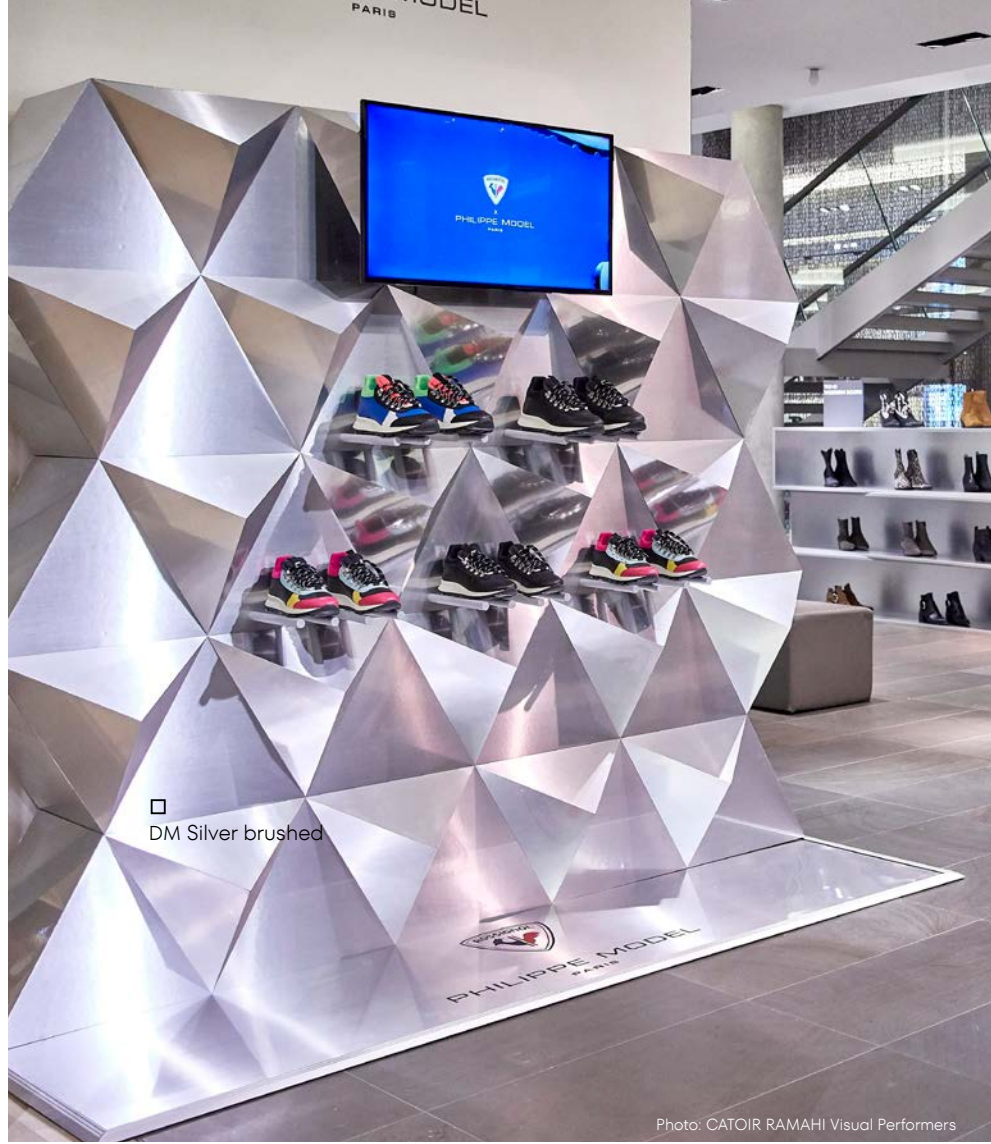
□ DM Silver brushed

2000 x 1000 | NA 10286 | SA 10296 (DISCONTINUED)