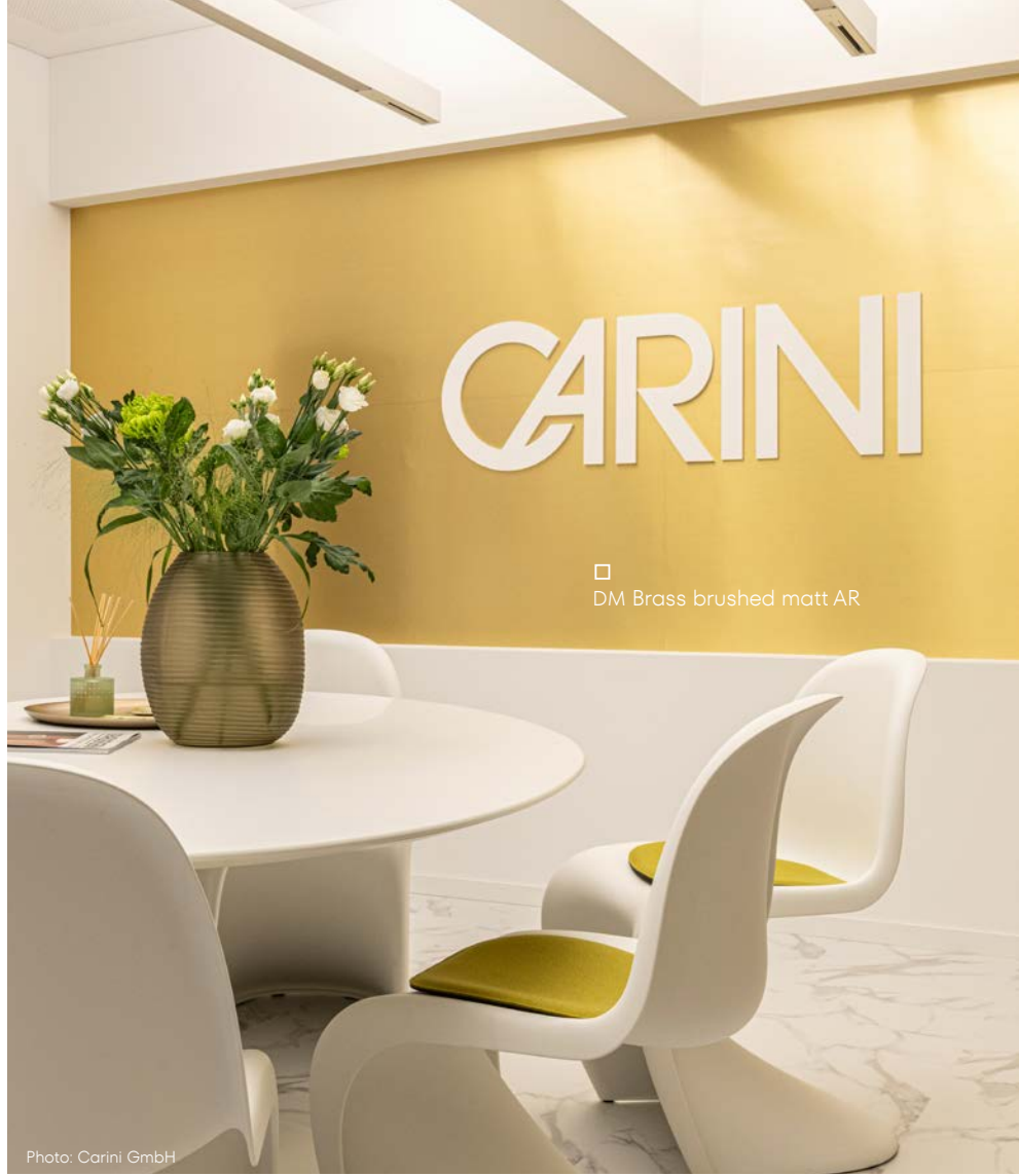
□ DM Brass brushed matt AR