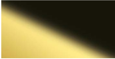
DM OPTICAL MIRROR Brass AR 2800 x 1250 | NA 21242